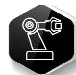
Automations & Robotics